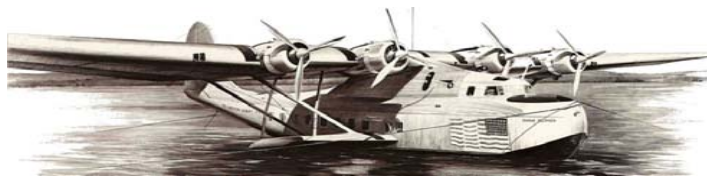
ART BY DAN WITKOFF

In 1935, there were very few long runways that could handle large airplanes. The flying boat overcame this handicap with ready-made water runways available all over the world. The small Pacific atolls provided ideal places to refuel and refit for the journey to the Orient.