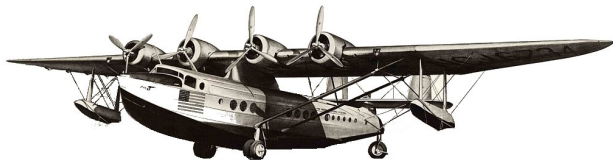
S-42 ART BY DAN WITKOFF